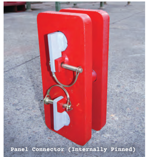
Panel Connector (Internally Pinned)

The Shore 141 Strut is a purpose-built lightweight pipe strut to suit the Shore 3m Trench Boxes, 3m Manhole Box and 4.2m-35 Trench Boxes. The Strut is offered in increments of 250mm from 600mm up to 4000mm. The Shore 141 Struts are connected to the side wall of the trench box spigots with connecting pins and locking clips, making assembly and dismantling quick and easy. No bolts and nuts or tools are required and there are no threads to get damaged.