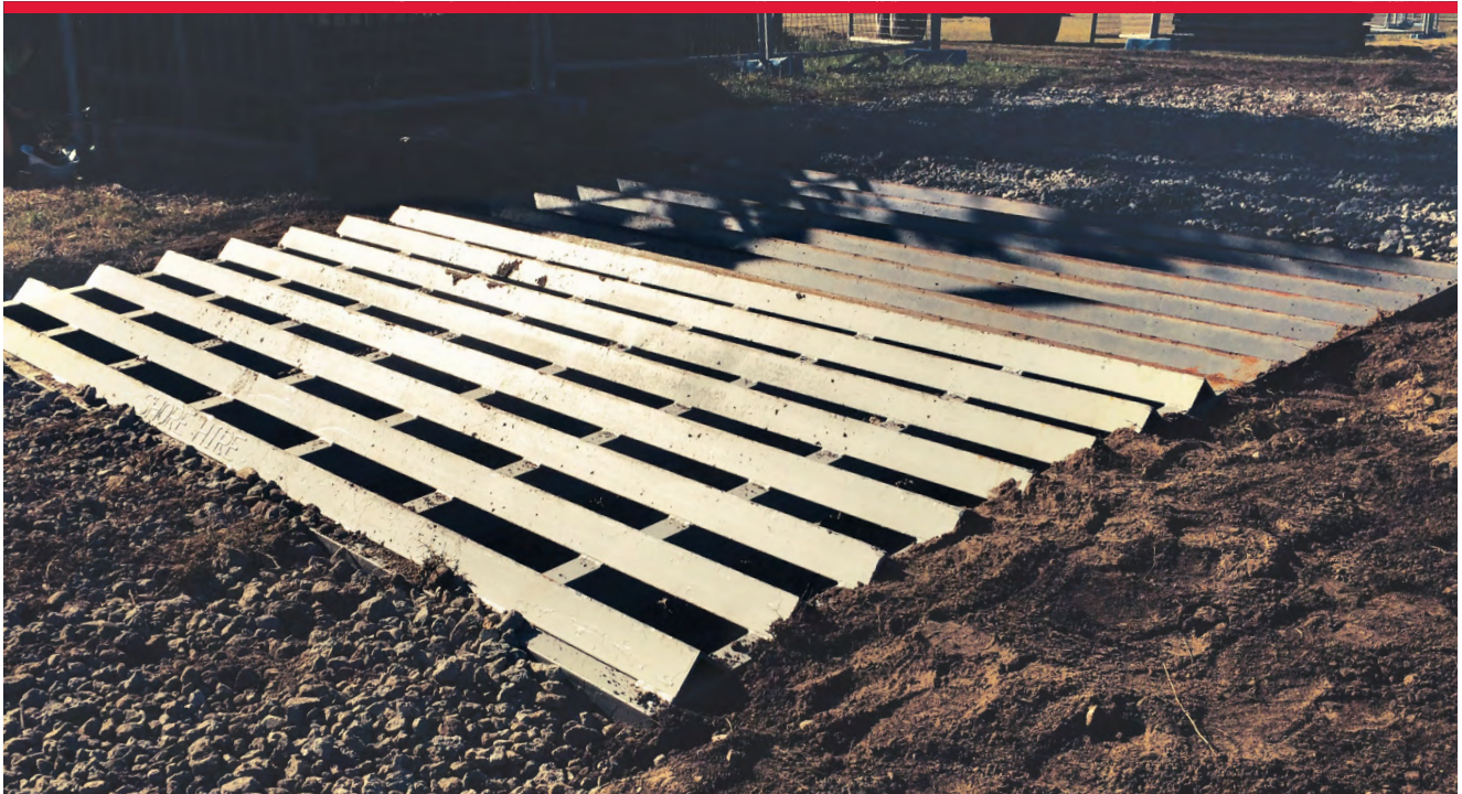
Rumble Grid Side Profile